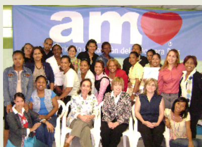
AMO Teacher Training Esperanza Foundation, DR