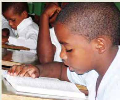
Young DR boy reading his new Bible